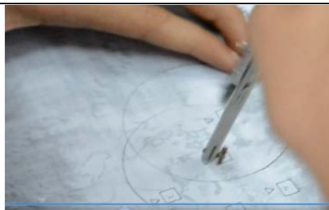
Fig. 4: Students' actions as seismologists

In terms of mathematics, the students had to identify that the epicentre of the earthquake was the common point of three intersecting circles whose centers were situated on three seismic stations (Fig. 4). In particular, they